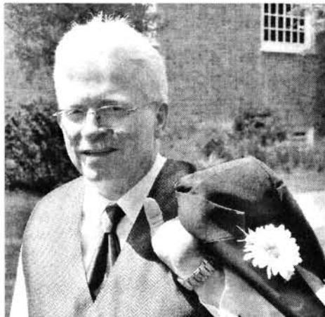
Hunter dressed to the nines.